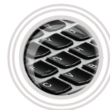
Black Silk Keyboard USB Wired