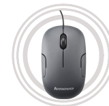
Black Silk Mouse USB Wired