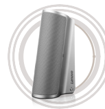
Lenovo™ 500 2.0 Bluetooth® Speaker