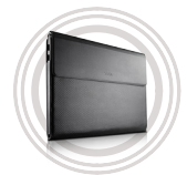
Yoga™ 14" Sleeve Black