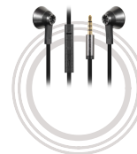
Lenovo™ 500 In-ear Headphones