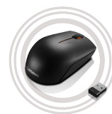
Lenovo™ 500 Compact Wireless Mouse