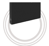
Lenovo™ UHD F308 1TB

Lenovo reserves the right to alter product offerings and specifications at any time, without notice. Lenovo makes every effort to ensure accuracy of all information but is not liable or responsible for any editorial, photographic or typographic errors. All images are for illustration purposes only. For full Lenovo product, service and warranty specifications visit www.lenovo.com . Lenovo makes no representations or warranties regarding third party products or services. Trademarks: The following are trademarks or registered trademarks of Lenovo: Lenovo, the Lenovo logo, ideapad, ideacentre, yoga and yoga home. Microsoft, Windows and Vista are registered trademarks of Microsoft Corporation. Ultrabook, Celeron, Celeron Inside, Core Inside, Intel, Intel Logo, Intel Atom, Intel Atom Inside, Intel Core, Intel Inside, Intel Inside Logo, Intel vPro, Itanium, Itanium Inside, Pentium, Pentium Inside, vPro Inside, Xeon, Xeon Phi, and Xeon Inside are trademarks of Intel Corporation in the U.S. and/or other countries. Other company, product and service names may be trademarks or service marks of others. Battery life (and recharge times) will vary based on many factors including system settings and usage. Visit www.lenovo.com/lenovo/us/en/safecomp/ periodically for the latest information on safe and effective computing. ©2016 Lenovo. All rights reserved.