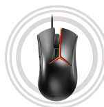
Y Gaming Optical Mouse