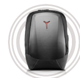
Y Gaming Armored Backpack