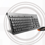
Lenovo Essential Wired Keyboard and Mouse Combo