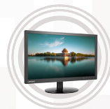
Lenovo LI2224 Monitor