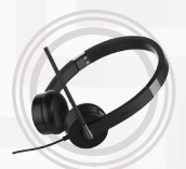
Lenovo Stereo Headset