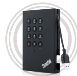
ThinkPad® USB 3.0 Portable Secure Hard Drive Fast & Secure