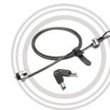
Kensington® MicroSaver® Security Cable Lock by Lenovo™ Ultra protection against thieves