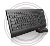
Lenovo™ Ultralim Wireless Keyboard and Mouse Combo Fast & Fluid