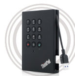
ThinkPad® USB 3.0 Portable Secure Hard Drive Fast & Secure