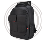
ThinkPad® Professional Backpack - Up to 15.6"