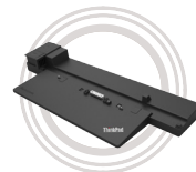
ThinkPad® Performance Dock