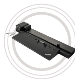
ThinkPad® Workstation Dock