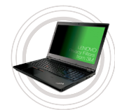
Lenovo™ Privacy Filters from 3M™