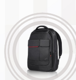
ThinkPad Professional Backpack