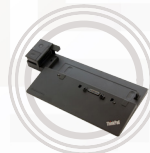
ThinkPad Ultra Dock