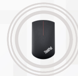
ThinkPad Precision Wireless Mouse