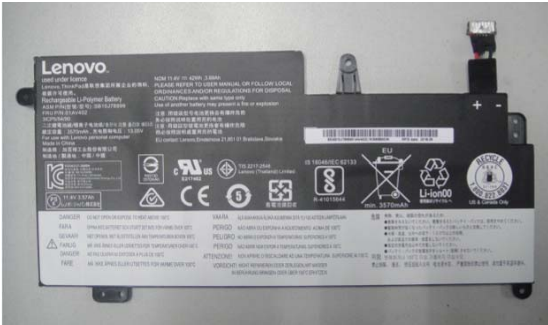
Figure photo of the pack