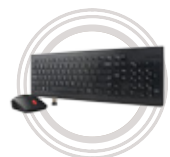
Lenovo 510 Wireless Combo Keyboard & Mouse

* Lenovo Zone will be available starting October 2017.