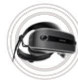
Lenovo Zone VR Headset*