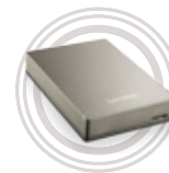
Lenovo UHD F309 USB 3.0 2 TB