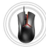
Lenovo Y Gaming Optical Mouse