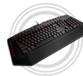
Lenovo Y Gaming Mechanical Switch Keyboard