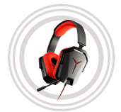
Lenovo Y Gaming Stereo Headset