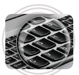
Black Silk Keyboard