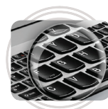
Silver Silk Keyboard