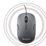
Silver Silk Mouse