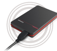
F310S USB 3.0 External Backup Hard Drive

* Example of Lenovo IdeaCentre AIO catalogue naming convention