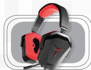
Lenovo Y Gaming Stereo Headset