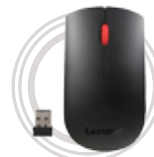
Lenovo 510 Wireless Mouse