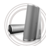
Lenovo 500 2.0 Bluetooth® Speaker