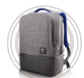
Lenovo 15.6" NAVA On-trend Backpack