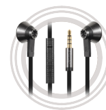
Lenovo 500 Extra Bass In-ear Headphones