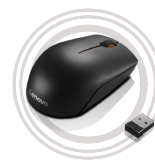
Lenovo 300 Wireless Compact Mouse