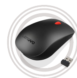
Lenovo 510 Wireless Mouse