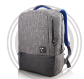
Lenovo 15.6" NAVA On-Trend Backpack

* Example of Lenovo IdeaPad catalogue naming convention