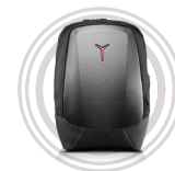
Y Gaming Armored Backpack