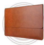
Yoga 920 Leather Sleeve