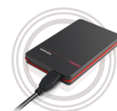
F310S USB 3.0 External Backup Hard Drive