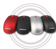
Lenovo 500 Wireless Compact Precision Mouse