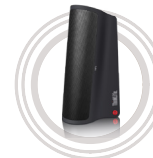
Lenovo 500 2.0 Bluetooth® Speaker