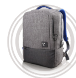
Lenovo 15.6" NAVA On-Trend Backpack

* Example of Lenovo IdeaPad catalogue naming convention