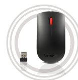
Lenovo 510 Wireless Mouse