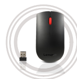
Lenovo 510 Wireless Mouse