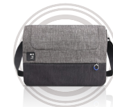
NAVA On-Trend Messenger