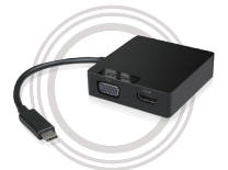
Lenovo USB-C Travel Hub