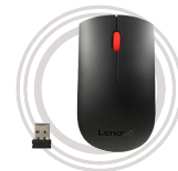
Lenovo 510 Wireless Mouse