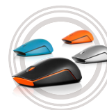
Lenovo 500 Wireless Mouse