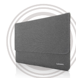
Lenovo 11"/12" Ultra Slim Sleeve