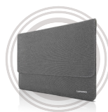
Lenovo Ultra Slim Sleeve