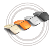
Lenovo Yoga Mouse