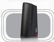
Lenovo 500 2.0 Bluetooth® Speaker