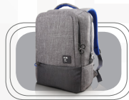
Lenovo 15.6" NAVA On-Trend Backpack