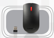
Lenovo 510 Wireless Mouse