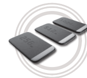
Lenovo USB-C SSD