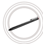
Lenovo Active Pen 2