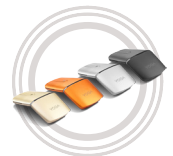
Lenovo Yoga™ Mouse