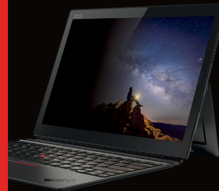
◀ Lenovo Privacy Filter for X1 Tablet G3 from 3M