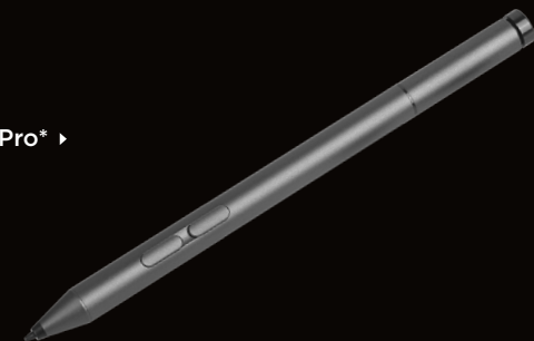
Lenovo Pen Pro* ▶