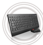
Lenovo™ Ultralim Wireless Keyboard and Mouse Combo Fast & Fluid