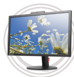
ThinkVision™ T-series Multimedia, Full-Series