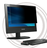
3M Monitor Privacy Filter Privacy Protection & Anti-Glare