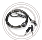
Lenovo™ Kensington® MicroSaver® DS Cable Lock Reduce Thieves, Easy to Install