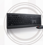
Lenovo Professional Wireless Keyboard & Mouse Combo