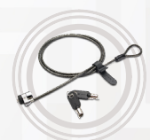
Kensington® Twin Head Cable Lock from Lenovo™