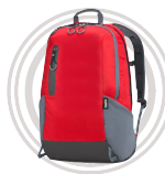
ThinkPad® Active Backpack Transitions Smoothly from the Office to your Active Lifestyle.