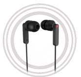
ThinkPad® In-ear Headphones Simple and Comfortable.