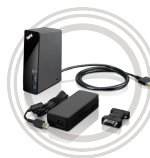
ThinkPad® OneLink Dock OneLink, Link it All.