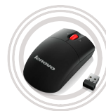
ThinkPad® Optical Wireless Mouse Mouse for All.