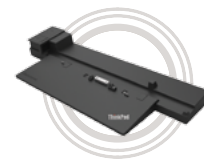
ThinkPad® Performance Dock