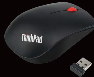
◀ ThinkPad Essential Wireless Mouse