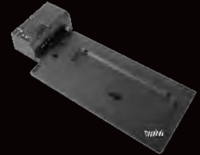
ThinkPad Pro Dock ▶