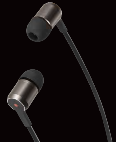
Lenovo In-ear ▶ Headphones