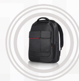
ThinkPad Professional Backpack