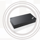
ThinkPad ThunderBolt Dock