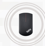
ThinkPad Precision Wireless Mouse