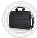
ThinkPad® Professional Backpack