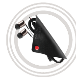
ThinkPad® Noise-cancelling Earbuds