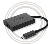
Lenovo™ USB-C to HDMI™ Adapter