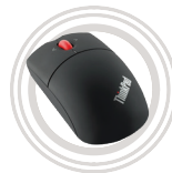
Bluetooth® Laser Wireless Mouse