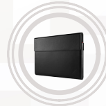
ThinkPad X1 Ultra Sleeve