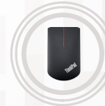
ThinkPad X1 Wireless Touch Mouse