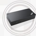
ThinkPad Thunderbolt 3 Dock