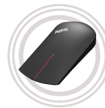
ThinkPad@ X1 Wireless Touch Mouse