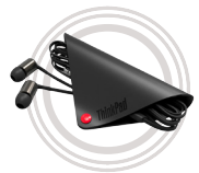
ThinkPad@ X1 In-Ear Headphones