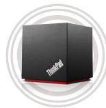
ThinkPad@ WiGig Dock