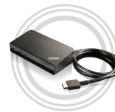
ThinkPad@ OneLink+ Dock