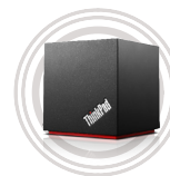
ThinkPad® WiGig Dock

Superior sound quality with a comfortable fit