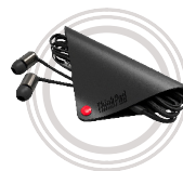
ThinkPad® X1 In Ear Headphones

Superior sound quality with a comfortable fit