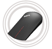
ThinkPad® X1 Wireless Touch Mouse

Wirelessly connect and expand the function of your device