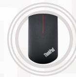
ThinkPad Precision Wireless Mouse