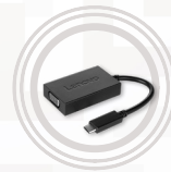
Lenovo USB-C to VGA Adapter