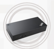
ThinkPad ThunderBolt Dock