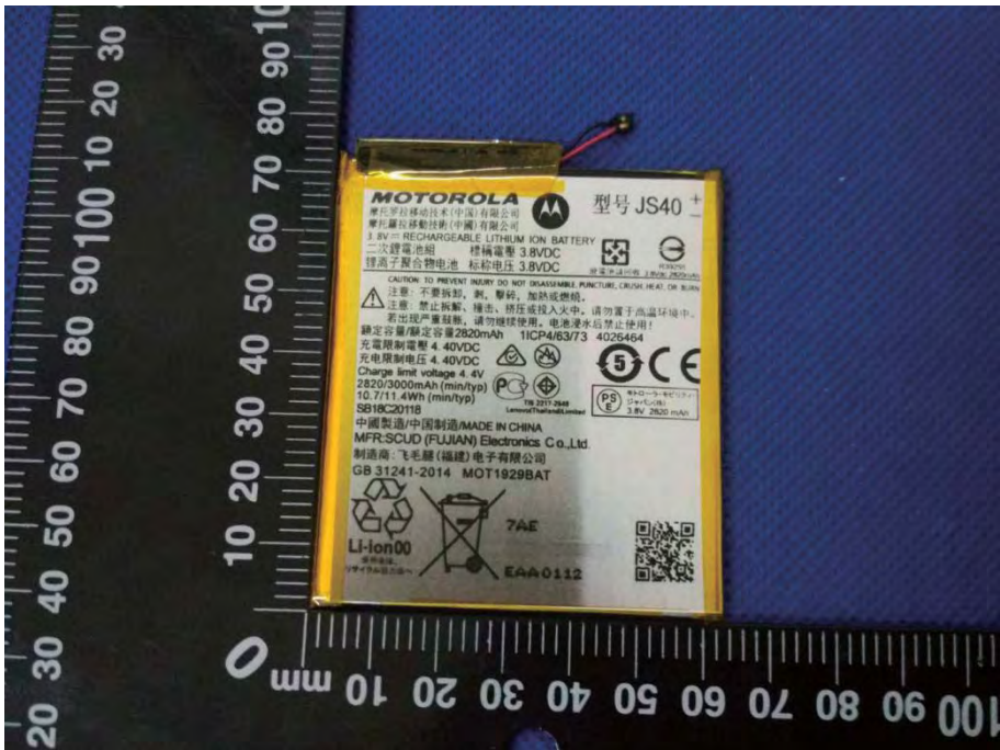
电池组外观 Battery appearance