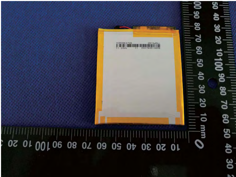
电池组外观 Battery appearance