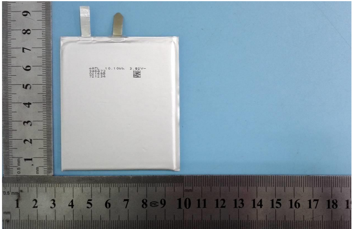
Cell (346473 3.82V 2645mAh)