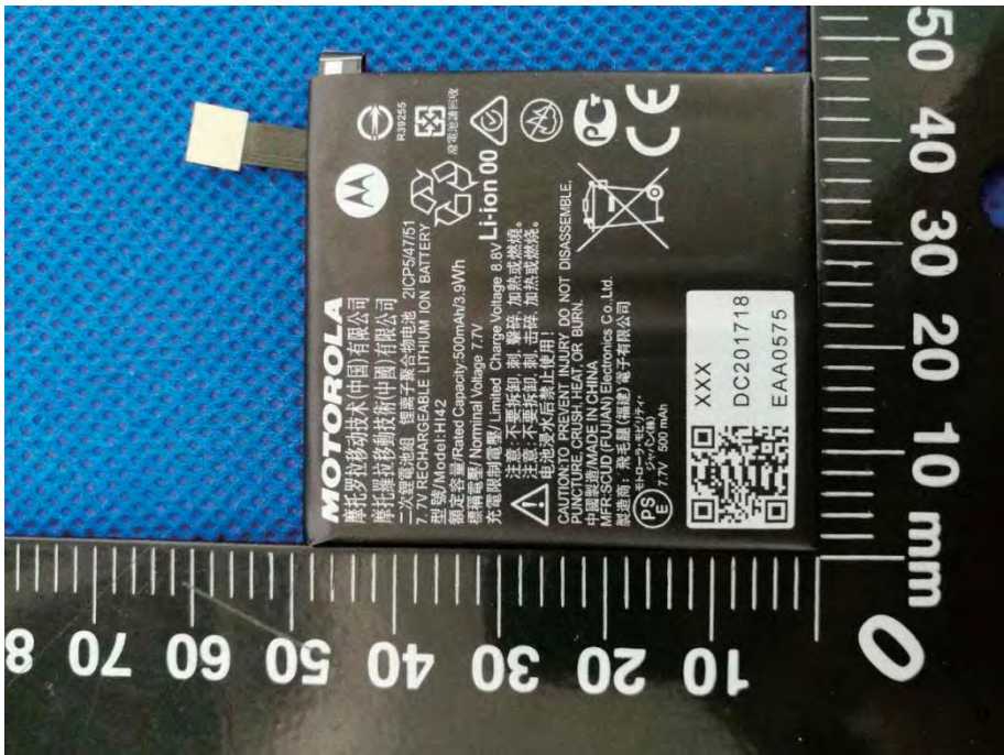
电池组外观 Battery appearance