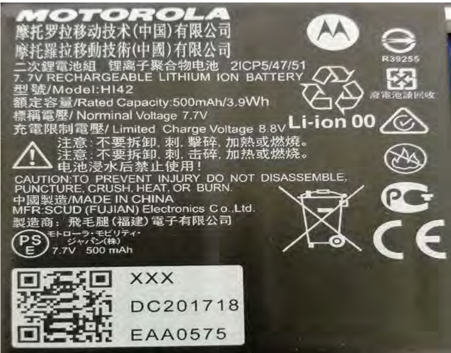
电池组铭牌 Battery Nameplate